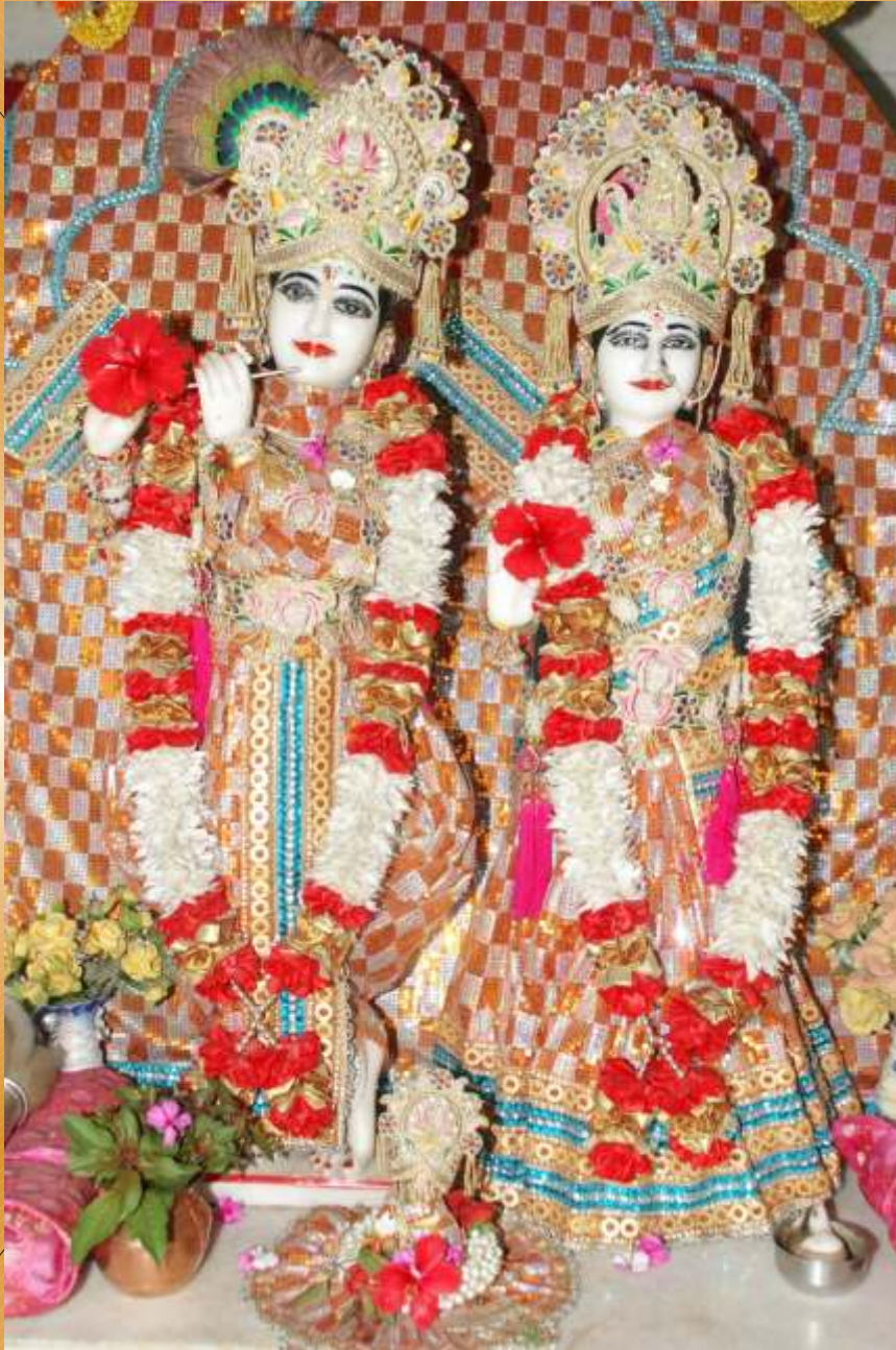
RADHA MADHAV MANDIR at Winsome Textile Industries Limited, Baddi (HP)

If undelivered, please return to : Winsome Textile Industries Limited Corp. Office: SCO 191-92, Sector 34 A, Chandigarh 160 022 India